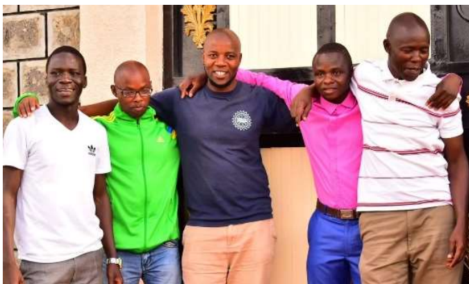
Male staff at Life4Kids in Nairobi, Kenya

many challenges at the home in Nairobi: a devastating fire in the home in February; the COVID-19 pandemic that closed schools and imposed a