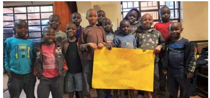
"Thanks" from boys for new art supplies.

So, this month we want to share with you some fun recently experienced by the boys and staff. Two of our supporters contributed additional funds earmarked for art supplies and for a "day out" for the boys and staff