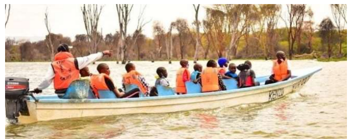
The boys had their first boat ride.

So often we report to you on serious subjects like COVID-19 in Kenya, the economic situation in Kenya, the challenges faced by the home and staff, rising costs for Life4Kids in Kenya, or school related issues.