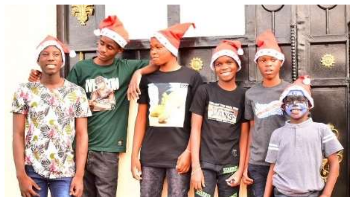
Christmas cheer from some of the Life4Kids boys

Donate Now: If sponsorship is not possible for you to undertake, we would be grateful for your financial support. If you could set up a monthly donation, that would be so helpful in meeting rising costs. Go to www.life4kidscanada.ca and click “ Donate Now ”.