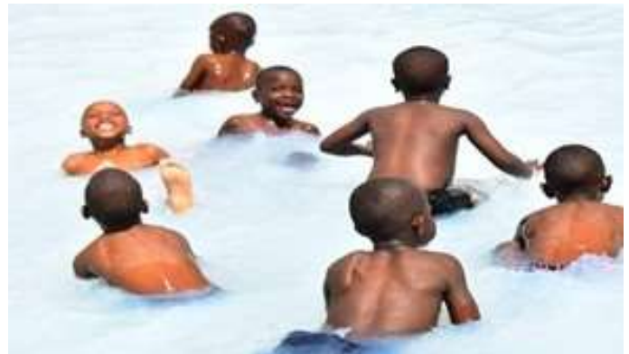
The boys went swimming, a special outing.

Three of the big boys (18 and over) are now in college or university. One boy just started college and is coping very well with his new friends and new surroundings.