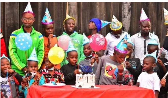
A birthday party for ALL the boys on the same day.

So often we report to you on serious subjects like COVID-19 in Kenya, the economic situation in Kenya, the challenges faced by the home and staff, rising costs for Life4Kids in Kenya, or school related issues.