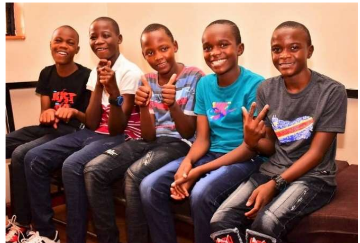
"Little boys" grow up and education costs mount.

Every parent knows that the older the kids, the more their educations cost. We're pleased to have one boy in university now, two in colleges, one who just graduated from high school, and six others in high school. So, we're starting a special fund for the education of the boys. If you'd like to donate to this Fund, go to our website to donate online, specifying the "Education Fund."