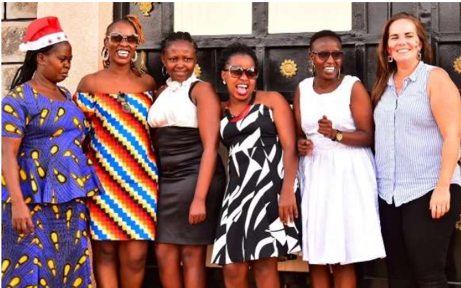
Female staff at Life4Kids in Nairobi, Kenya

Sincere Thanks: As we begin a new year, we want to take this opportunity to extend our heartfelt thanks for the support that our donors have provided to Life4Kids during the past year. We have overcome