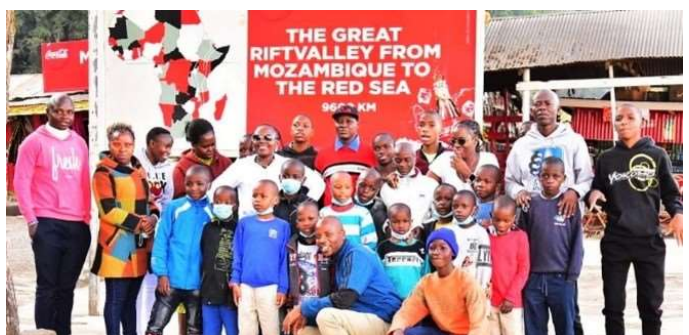
The boys visited The Great Rift Valley.